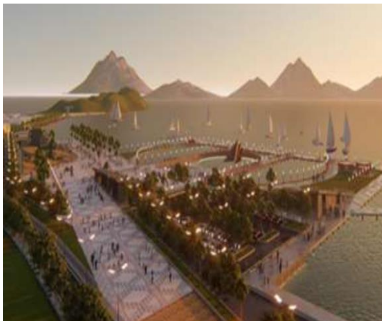
FIGURE 3. ARTISTS IMPRESSION OF THE MARINA PLANNED IN LABUAN BAJO

The composition of the workforce in the tourism sector in Labuan Bajo was 1,980 (45%) female and 2,432 (55%) males. The majority were working in starred and non-starred hotels; the total number were 824 women and 1,129 men. An estimated 478 people (28% women) were working in the travel related services sector and 910 people (71.2% women) were working in restaurants and catering services. Aquatic tourism companies (594 people, 17.8% women) were also a substantial employer.